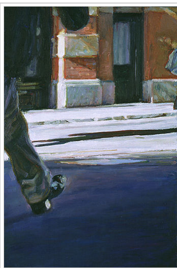
Pursuit . 2001. Oil on panel.