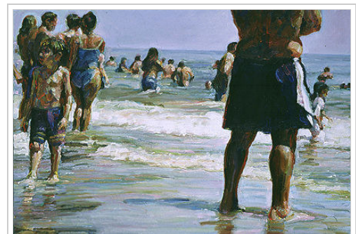
Daddy . 2001. Oil on panel.