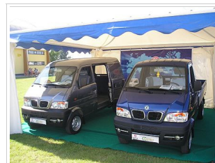
Pyeonghwa Paso 990.