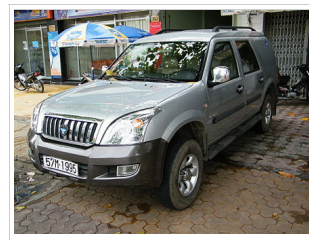
Pyeonghwa Pronto GS.