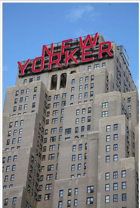
Close-up of the tower

the United States for $5.6 million. The church converted much of the building for use by its members. [15]