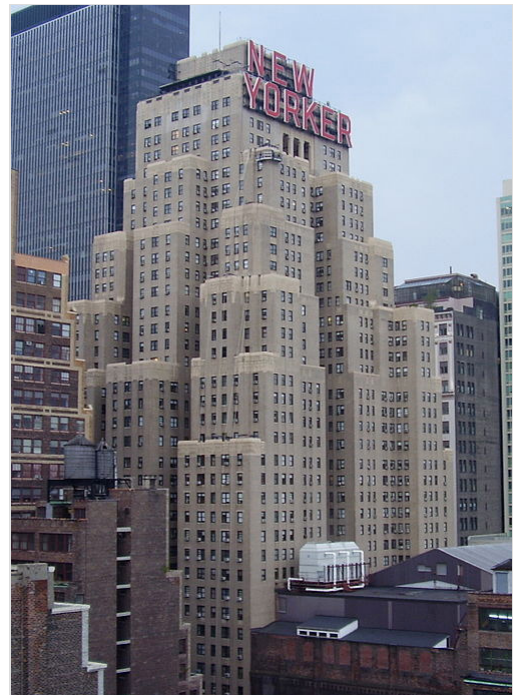
The hotel, with its large "New Yorker" sign