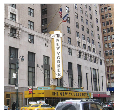
8th Avenue entrance

In August 2007, the hotel began a second capital improvement program, which was completed in February 2009 at a final cost of $70 million. These improvements increased the number of guest rooms available to 912 from just 178 in 1994, located on floors 19 through 40. [18][19]