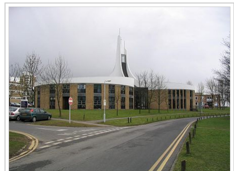
Lancaster University's Chaplaincy Centre