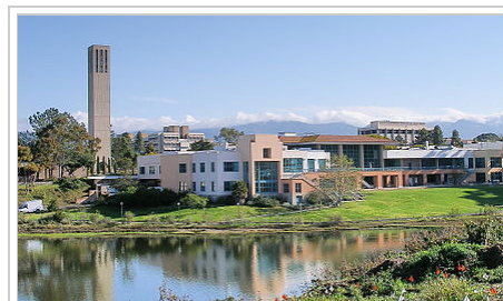
The University of California at Santa Barbara University Center and Lagoon

Smart was also visiting professor at Varanasi in India, Yale, Wisconsin, Princeton, Queensland, and the respected Religious Studies department at Lampeter, in Hong Kong and elsewhere. Lectures delivered in Delhi were published as The Yogi and the Devotee (1968). In 1967, he presented the Heslington Lectures at the University of York, in which he set out his ideas about secular Religious Studies subsequently published as Secular Education and the Logic of Religion (1967), further developing these in his inaugural lecture at Lancaster, published as Concept and Empathy (1986). In 1979–80, he presented the prestigious Gifford Lectures., published as Beyond Ideology (1981).